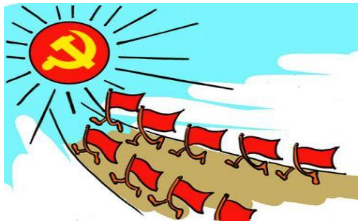
Figure 2 Ideological and political teaching materials

The ideological and political teaching materials used in almost all schools in our country are the teaching materials of national planning, but because of the rapid development of the world, many of the knowledge in the teaching materials are relatively backward, which can not keep up with the development of the world at present. And the innovation in the textbook is not high, so most students feel monotonous and boring when learning the textbook, and almost lose interest in learning. In addition, although the ideological and political curriculum is offered in schools, but the curriculum is too short, almost one or two courses a week, so teachers in the teaching process to teach students the content of teaching materials while enriching the extension of other content, time is completely not allowed, which also greatly reduces the students' learning ability.